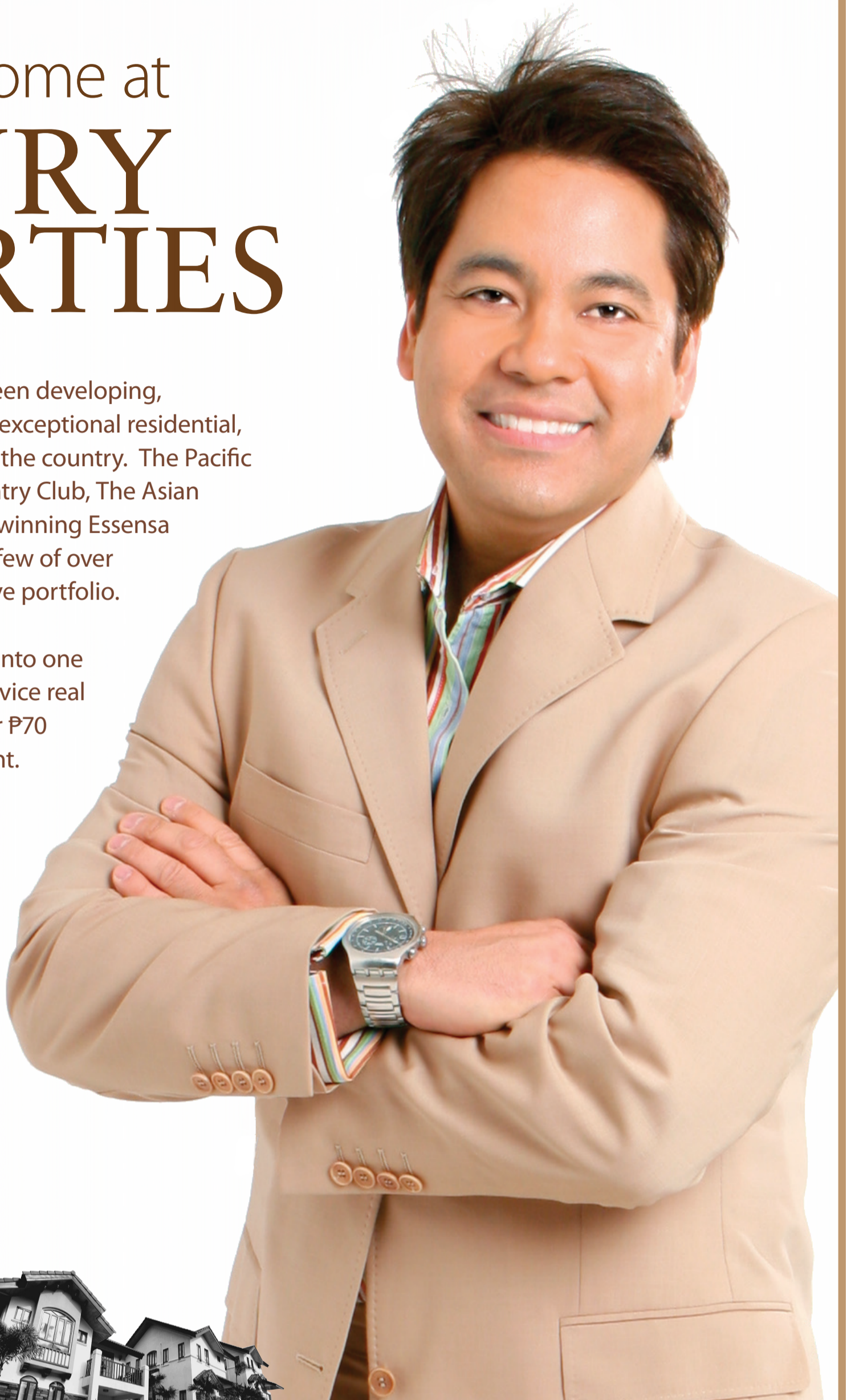
Century's Current Projects:

Today, the company has quietly grown into one of the LARGEST privately owned full service real estate firms in the Philippines, with over P70 billion in total assets under management. They have won such accolades like the Global Excellence Award for Most Outstanding Philippine Real Estate Firm, The National Product Quality Excellence Award for Best Philippine Real Estate firm, and the Most Outstanding Housing Developer from the Philippine Business World Quality Awards.