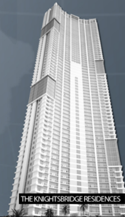
THE KNIGHTSBRIDGE RESIDENCES