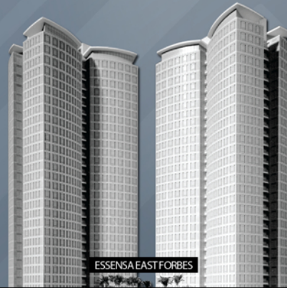
ESSENSA EAST FORBES